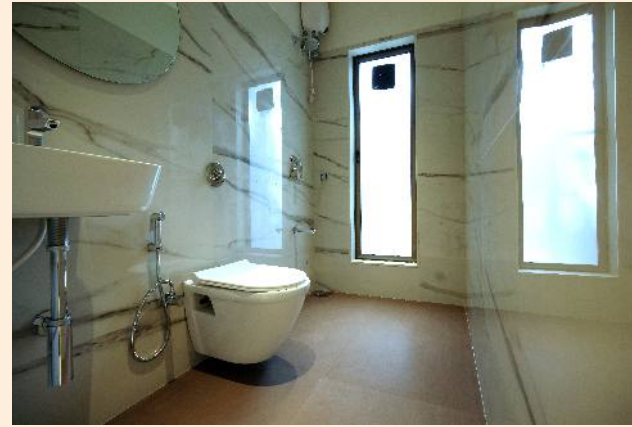
Actual photos of show flat