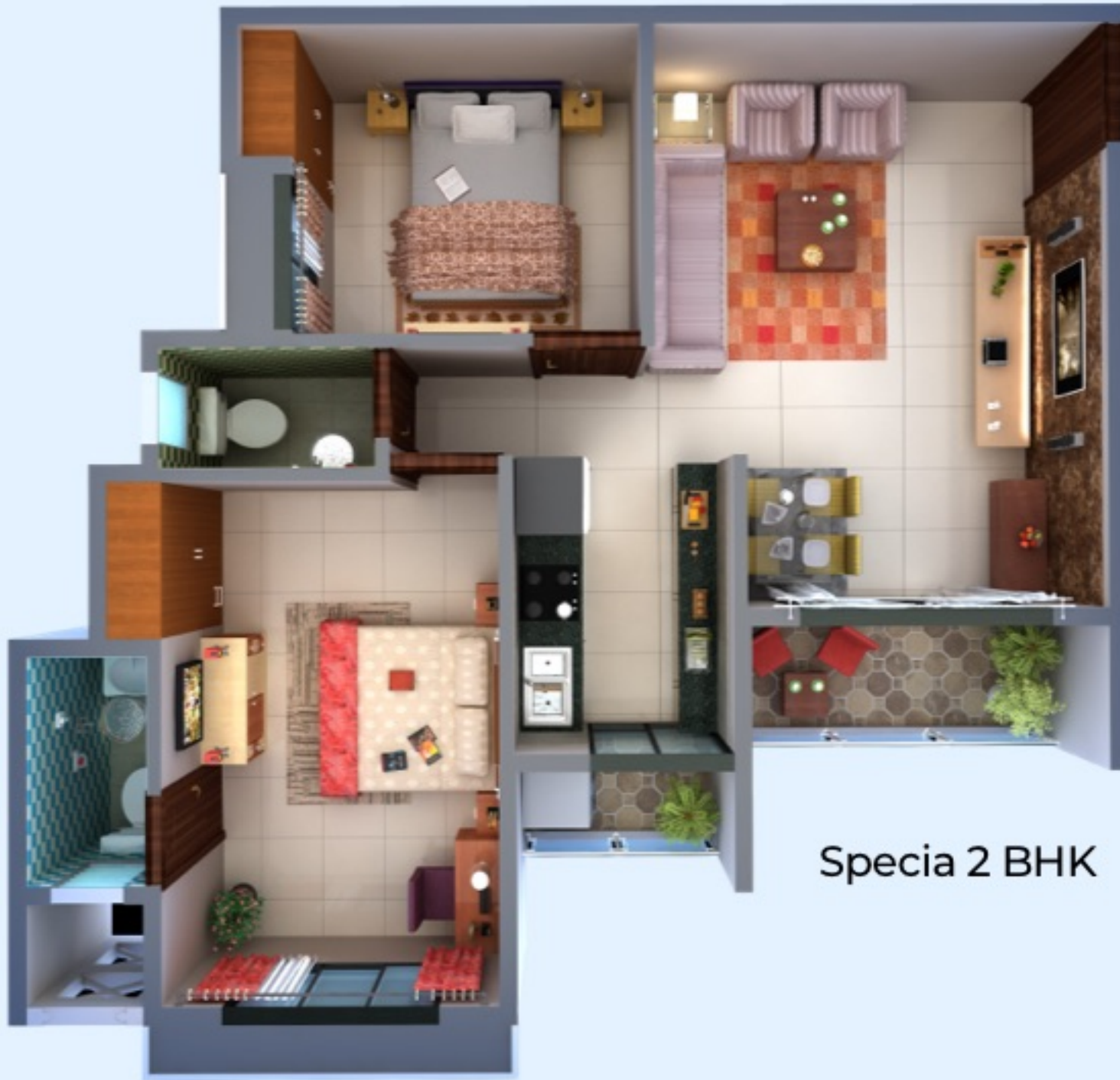
Specia 2 BHK