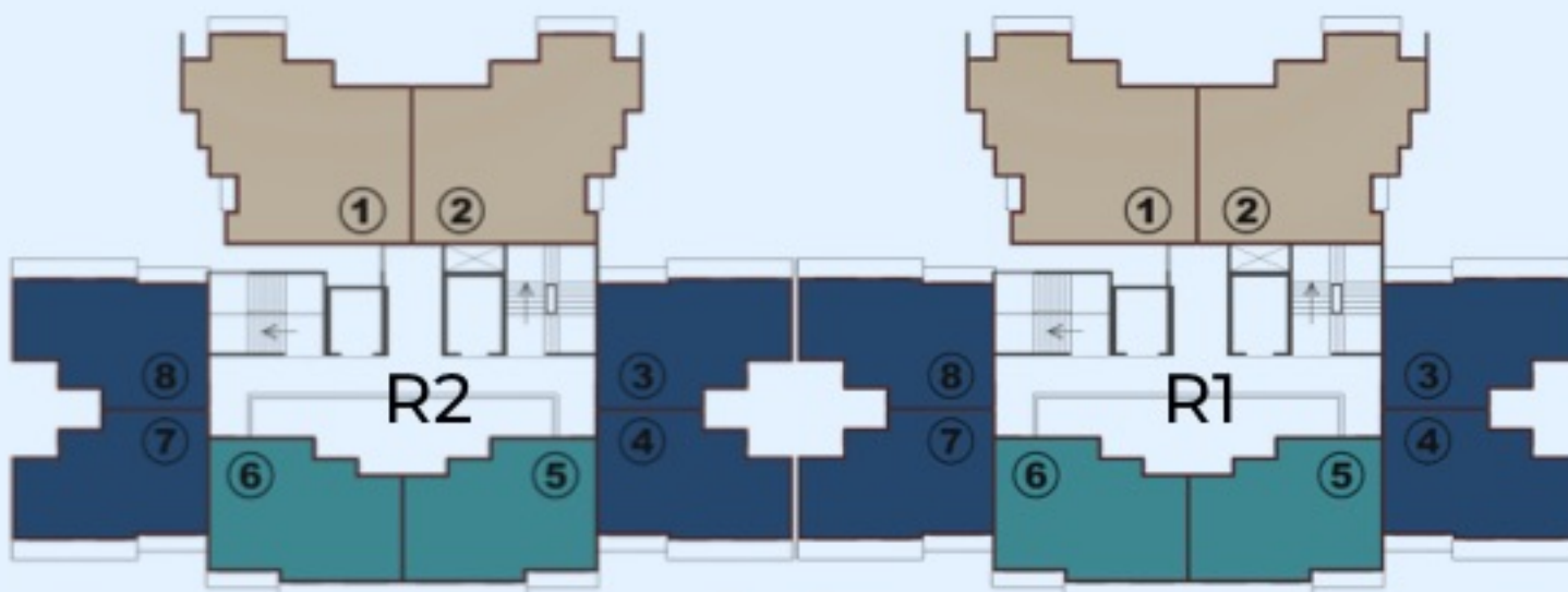
Navkar Majestic - Key Plan