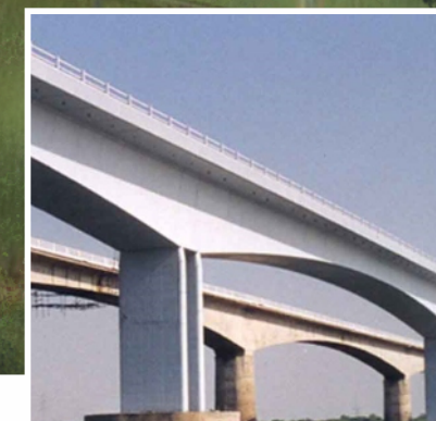
NAIGAON E/W BRIDGE