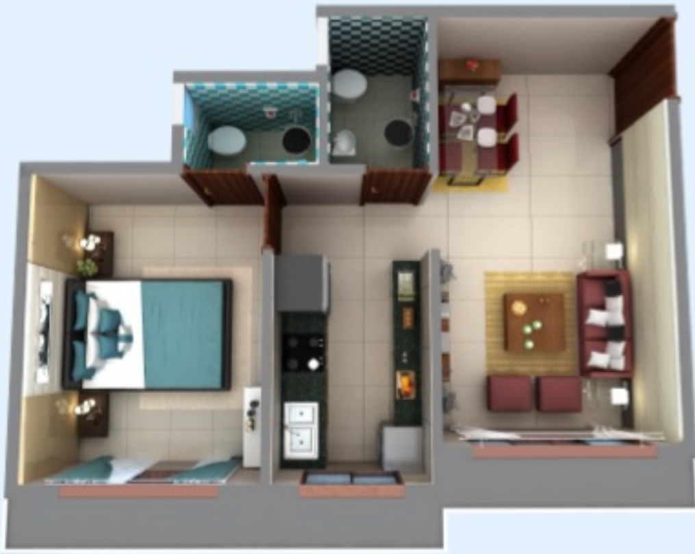
Smart 1 BHK