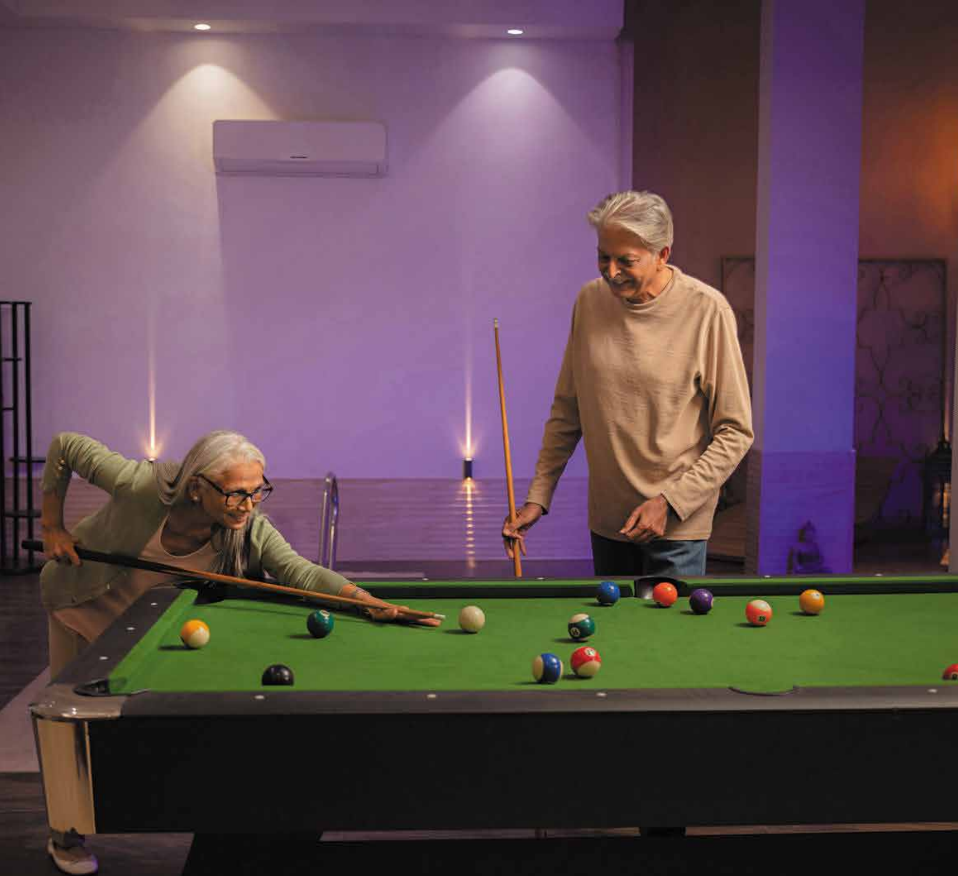
SENIOR CITIZENS AREA